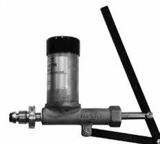
METHANOL INJECTOR Part No. ABJ-2