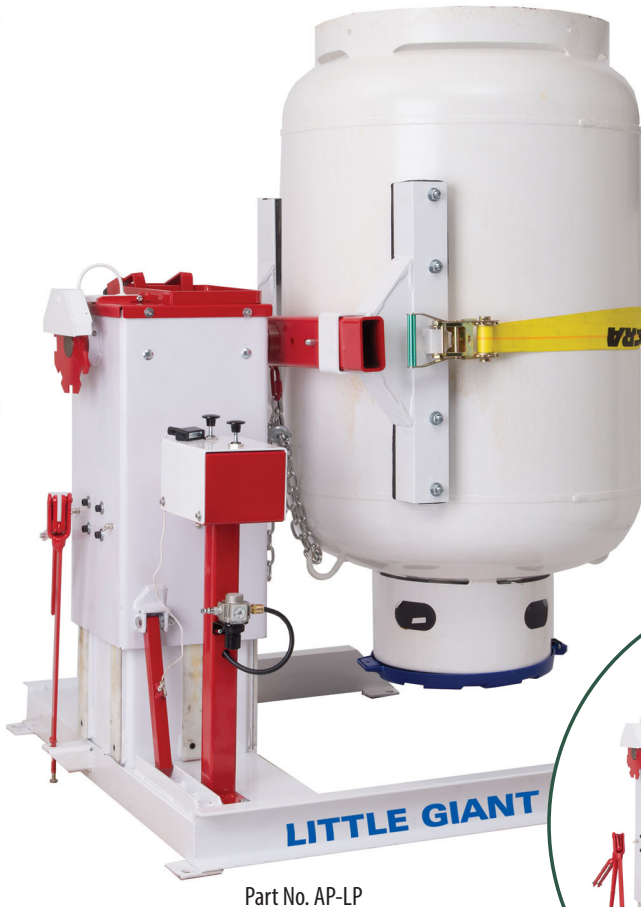
Part No. AP-LP

We're turning tank maintenance upside down again. The revolutionary Little Giant Air Powered Cylinder Inverter is easier, faster and safer than anything else you can buy. And it's backed by the best service in the industry. It has the same simple, durable design as the original Little Giant, with an innovative new air powered lifting/turning system. Plus, by preventing just one back injury claim, the inverter pays for itself.