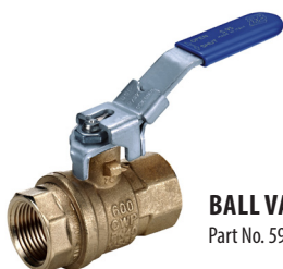
BALL VALVE Part No. 595C41