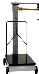
SCALES Part No. SP900