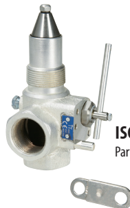
ISC VALVE Part No. A3209D080