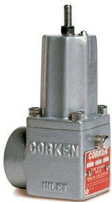
BYPASS VALVE Part No. B166B-.75BAU-Y