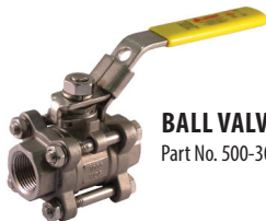
BALL VALVE Part No. 500-306