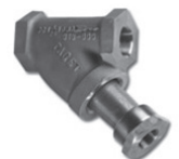
STRAINERS Part No. PS-10